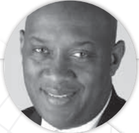
PENNSYLVANIA REP. DWIGHT EVANS

"My main objectives have been to reduce the high incidence of diet-related diseases by providing healthy food to underserved areas, to stimulate the investment of private capital in local neighborhoods, and to create living wage jobs. The Food Trust has been a creative and committed partner in the Fresh Food Financing Initiative movement."