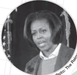
FIRST LADY MICHELLE OBAMA

"We know it won't be easy to solve this obesity crisis, because these big problems are never easy...But if there's anyone out there who doubts that it can be done, then I would urge them to come here to Philadelphia and to see what you've done here."